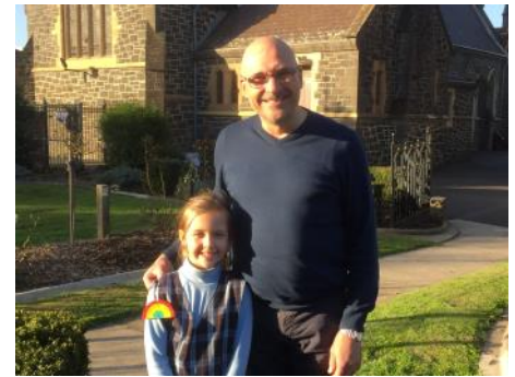
Farewell and smile often.